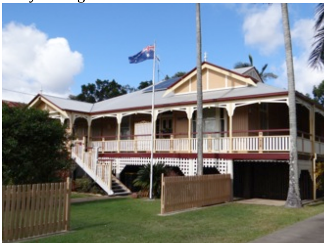
A classic Maryborough Queenslander